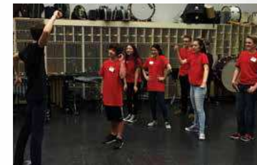
Middle school students take a theatre class led by HSPVA students.

Our annual Middle School Workshops provide opportunities for students in grades 6-8 to participate in classes taught by HSPVA upper-classmen. While participation has no effect on a student's application to HSPVA, the workshops provide excellent educational opportunities and unique introductions to the HSPVA campus. Visit www.hspvafriends.org for more information on upcoming Middle School Workshops.